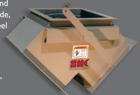
Manually operated Gates and Valves available.